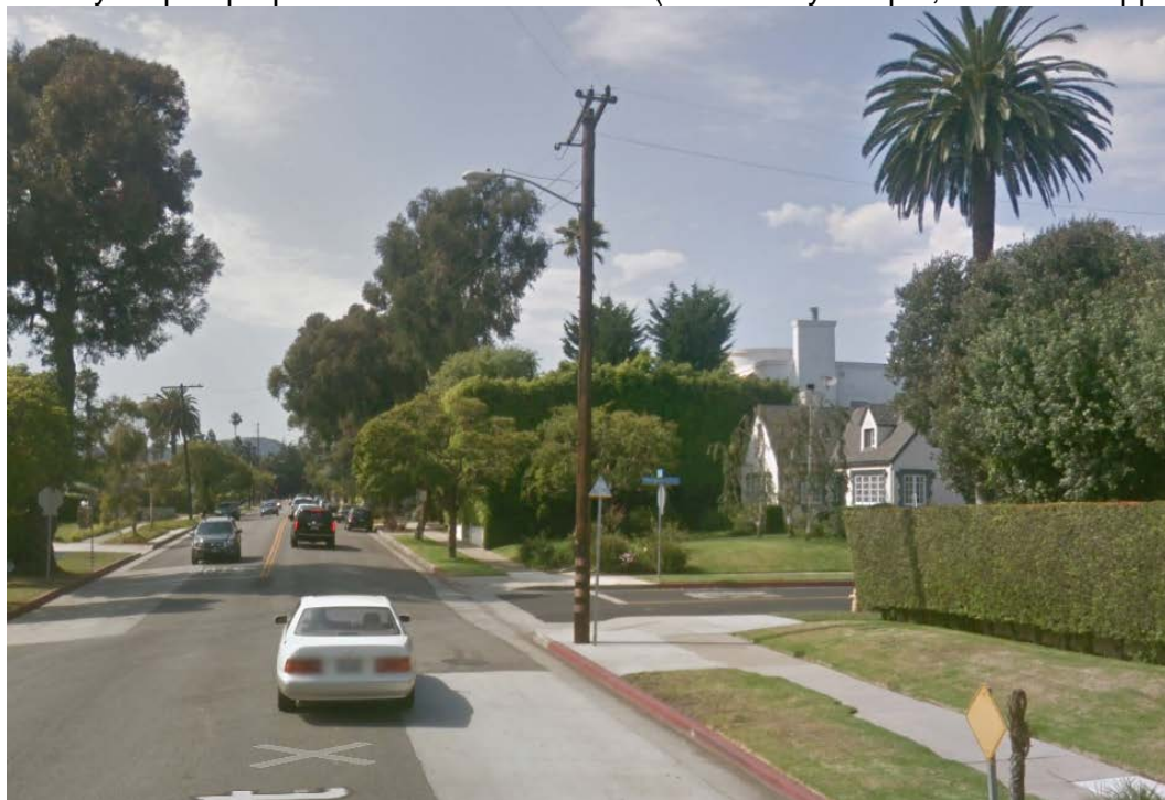
Street view of proposed installation location (looking north on 7 th Street)