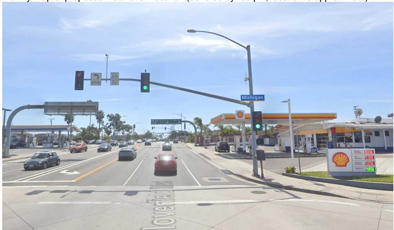
Street view of proposed installation location (looking south on Cloverfield Blvd)