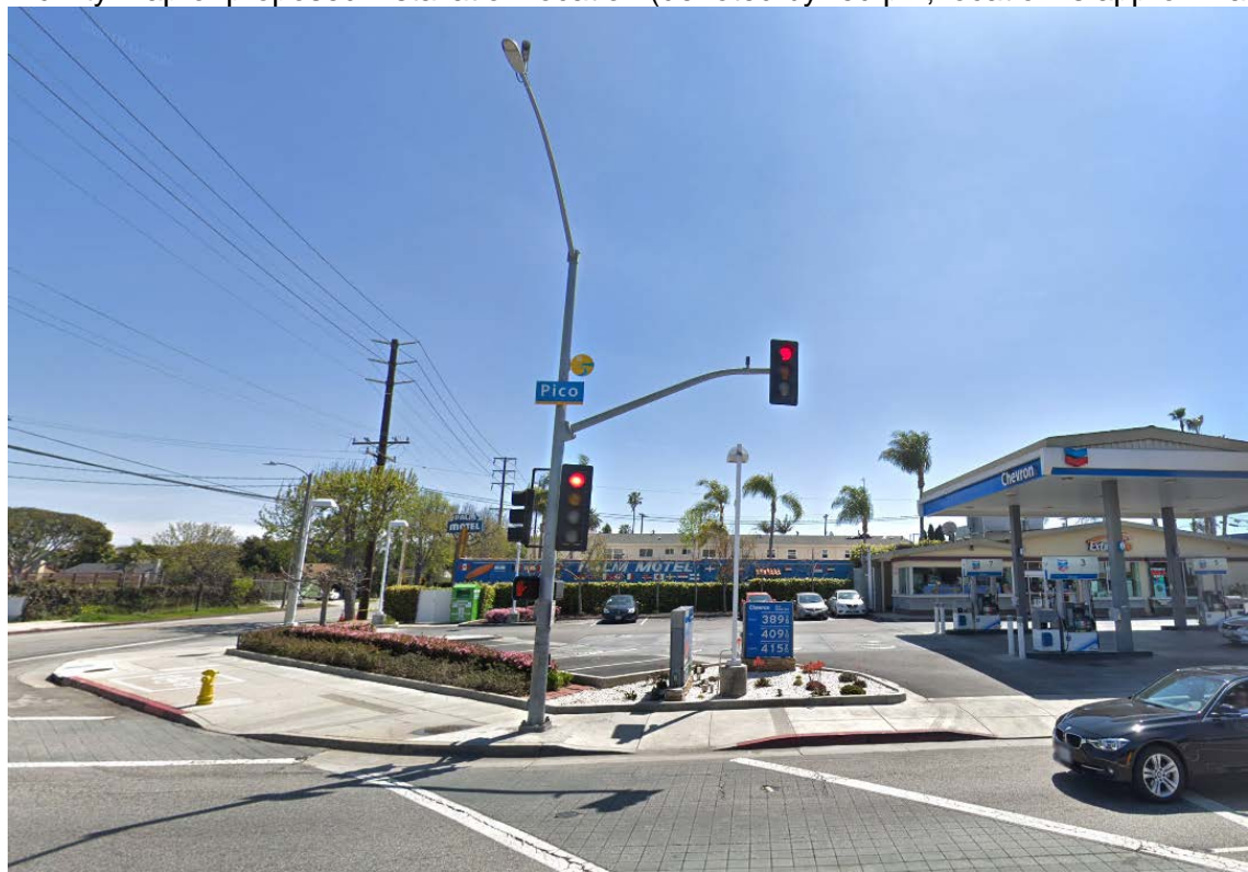
Street view of proposed installation location (looking south on 14 th St)