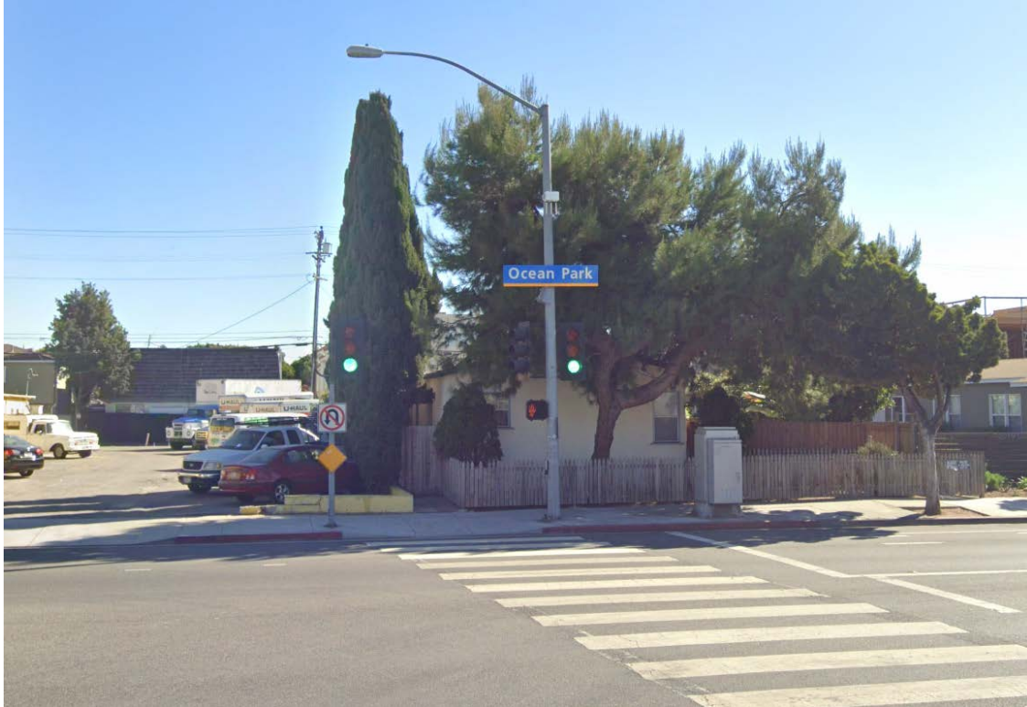
Street view of proposed installation location (looking east on Cloverfield Blvd)