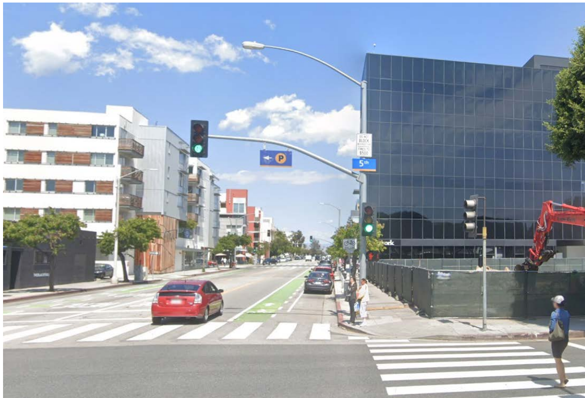
Street view of proposed installation location (looking east on Broadway)