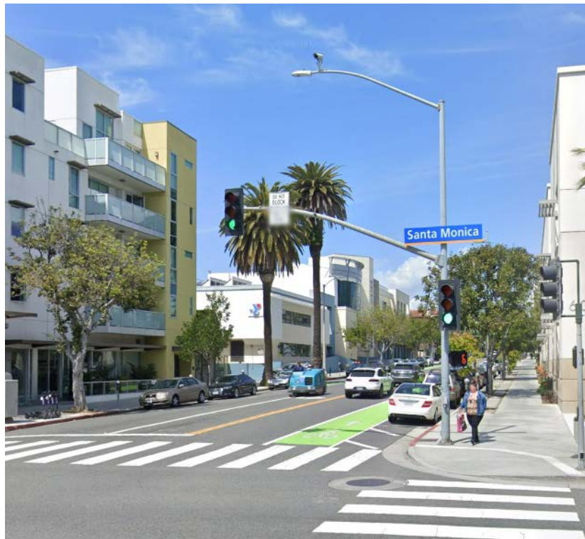
Street view of proposed installation location (looking north on 6 th St)