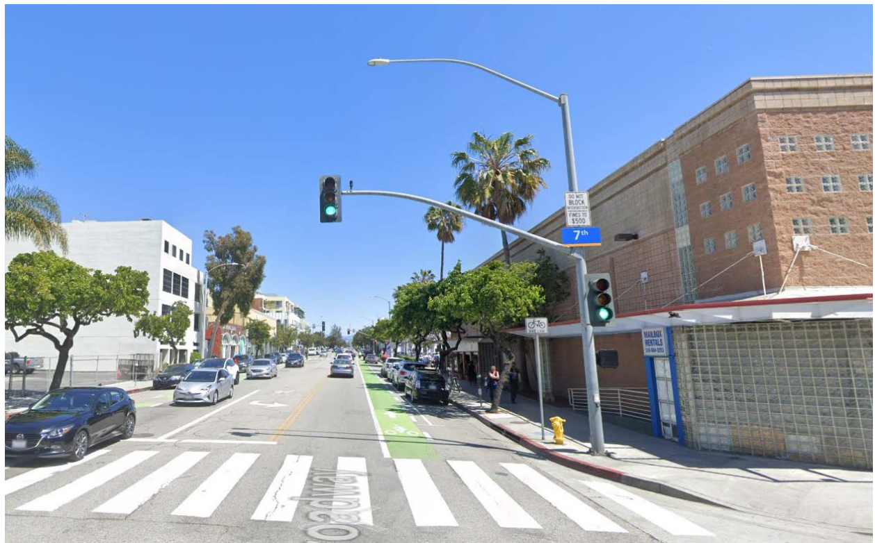
Street view of proposed installation location (looking east on Broadway)