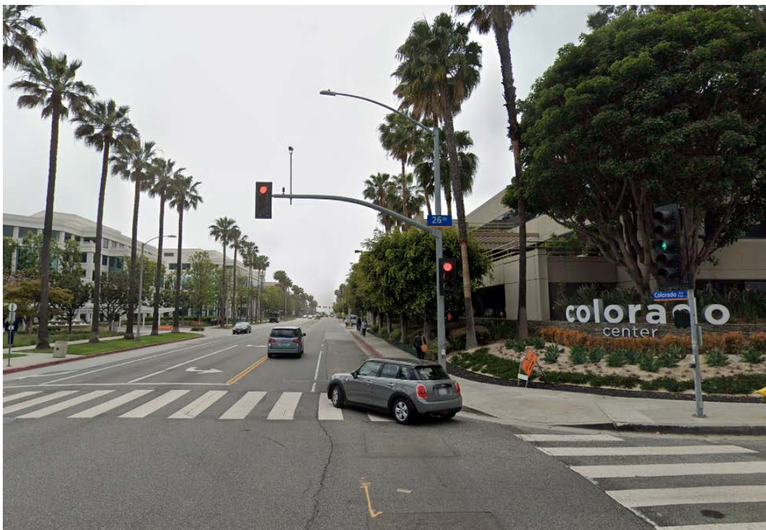
Street view of proposed installation location (looking west on Colorado Ave)