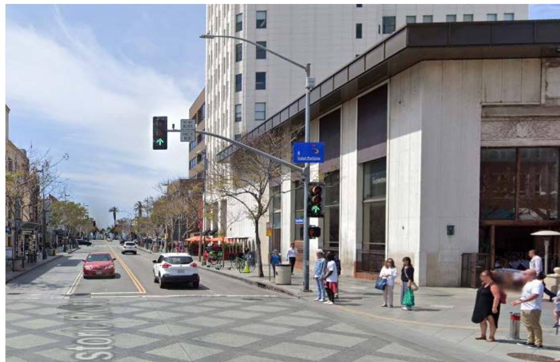
Street view of proposed installation location (looking west on Santa Monica Blvd)