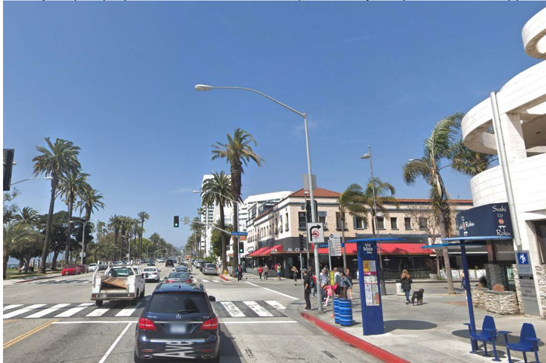
Street view of proposed installation location (looking north on Ocean Ave)