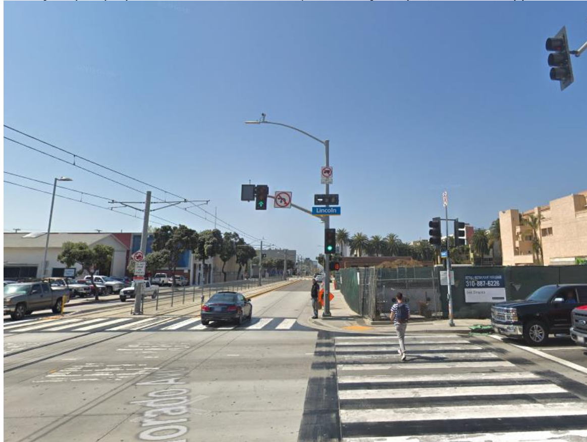
Street view of proposed installation location (looking west on Colorado Ave)