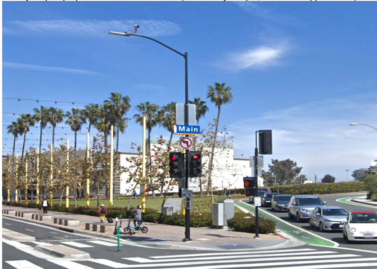
Street view of proposed installation location (looking east on Colorado Ave)