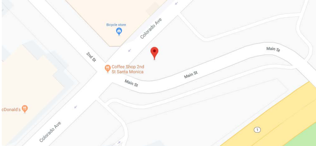
Vicinity map of proposed installation location (denoted by red pin; location is approximate)