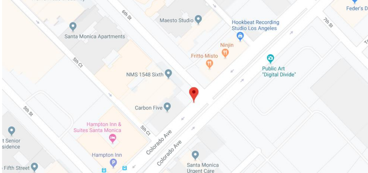
Vicinity map of proposed installation location (denoted by red pin; location is approximate)