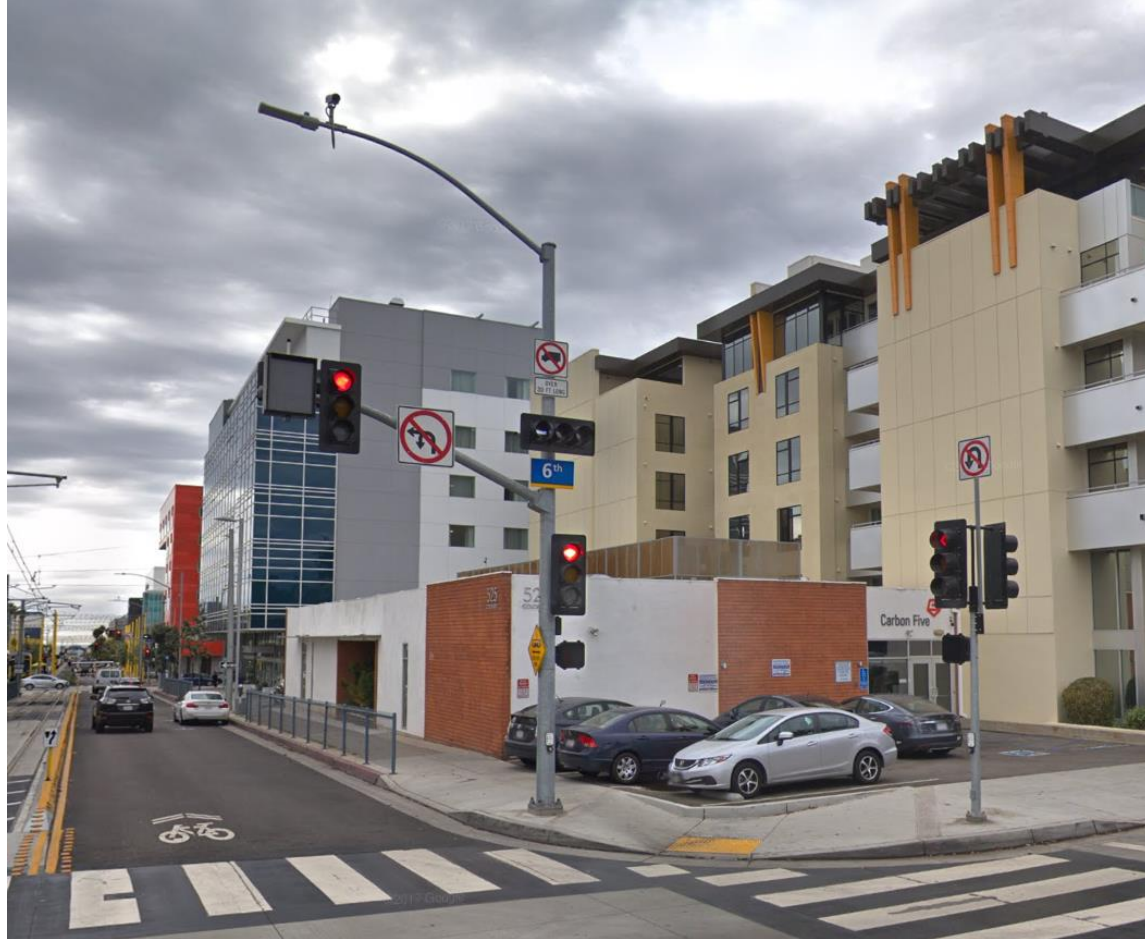
Street view of proposed installation location (looking west on Colorado Ave)