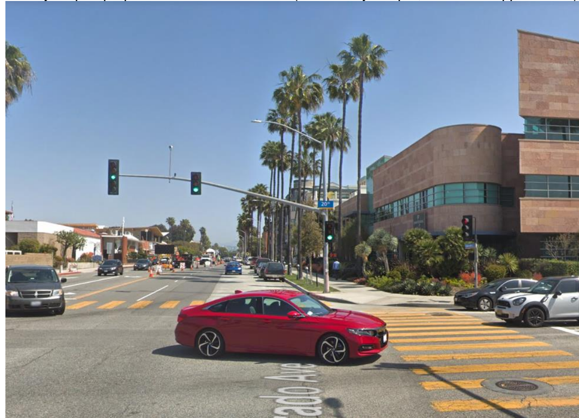
Street view of proposed installation location (looking east on Colorado Ave)