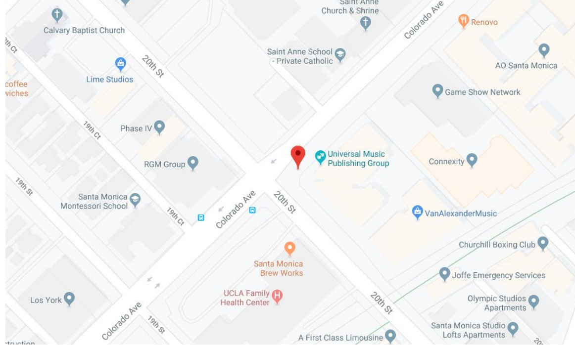
Vicinity map of proposed installation location (denoted by red pin; location is approximate)