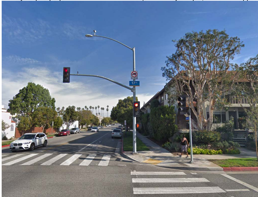
Street view of proposed installation location (looking east on Arizona Ave)