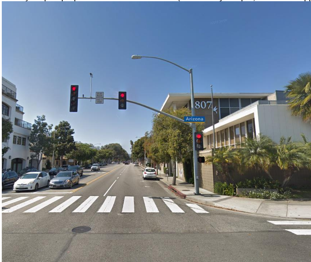
Street view of proposed installation location (looking north on Lincoln Blvd)