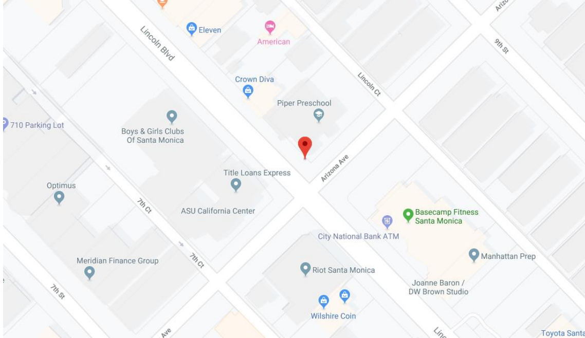
Vicinity map of proposed installation location (denoted by red pin; location is approximate)