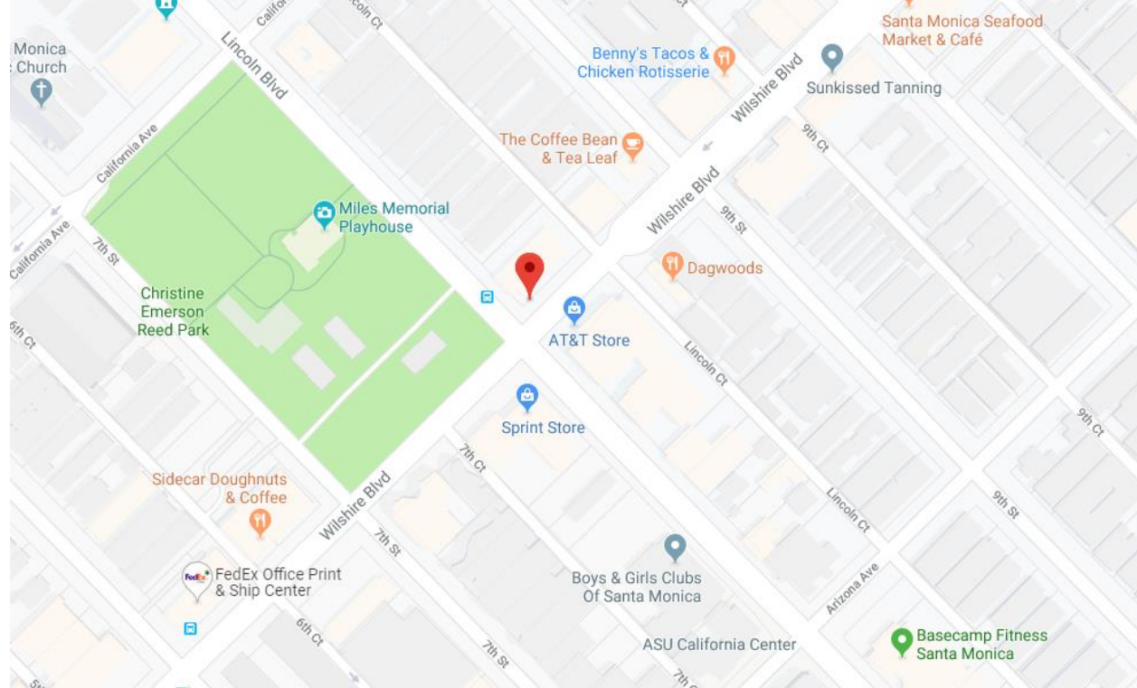
Vicinity map of proposed installation location (denoted by red pin; location is approximate)