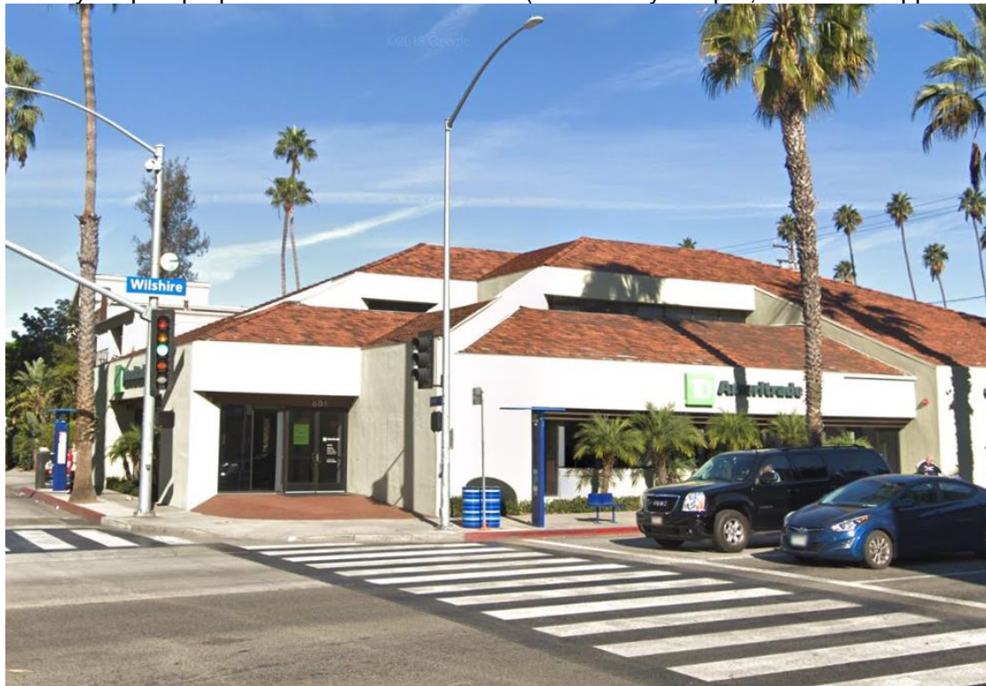
Street view of proposed installation location (looking north on Lincoln Blvd)