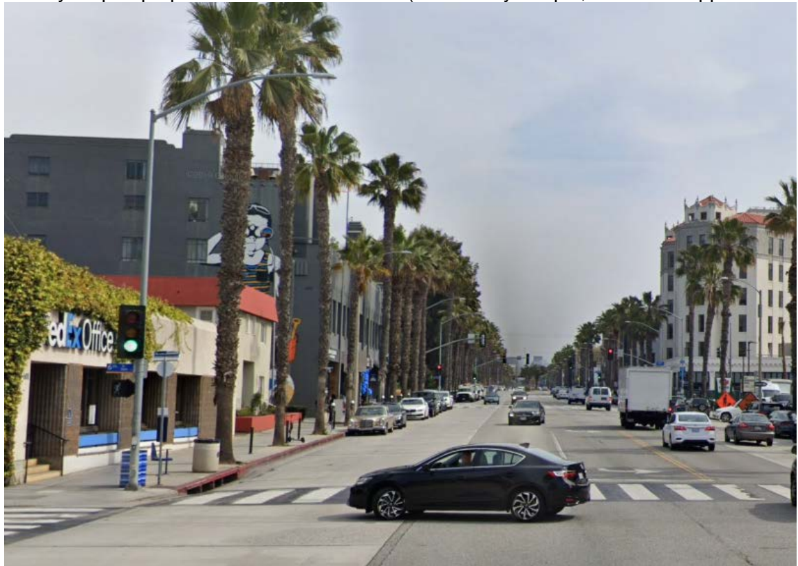
Street view of proposed installation location (looking east on Wilshire Blvd)