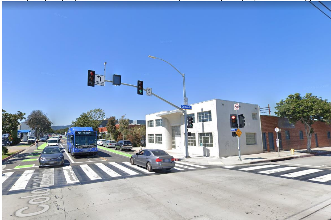
Street view of proposed installation location (looking north on 14 th St)