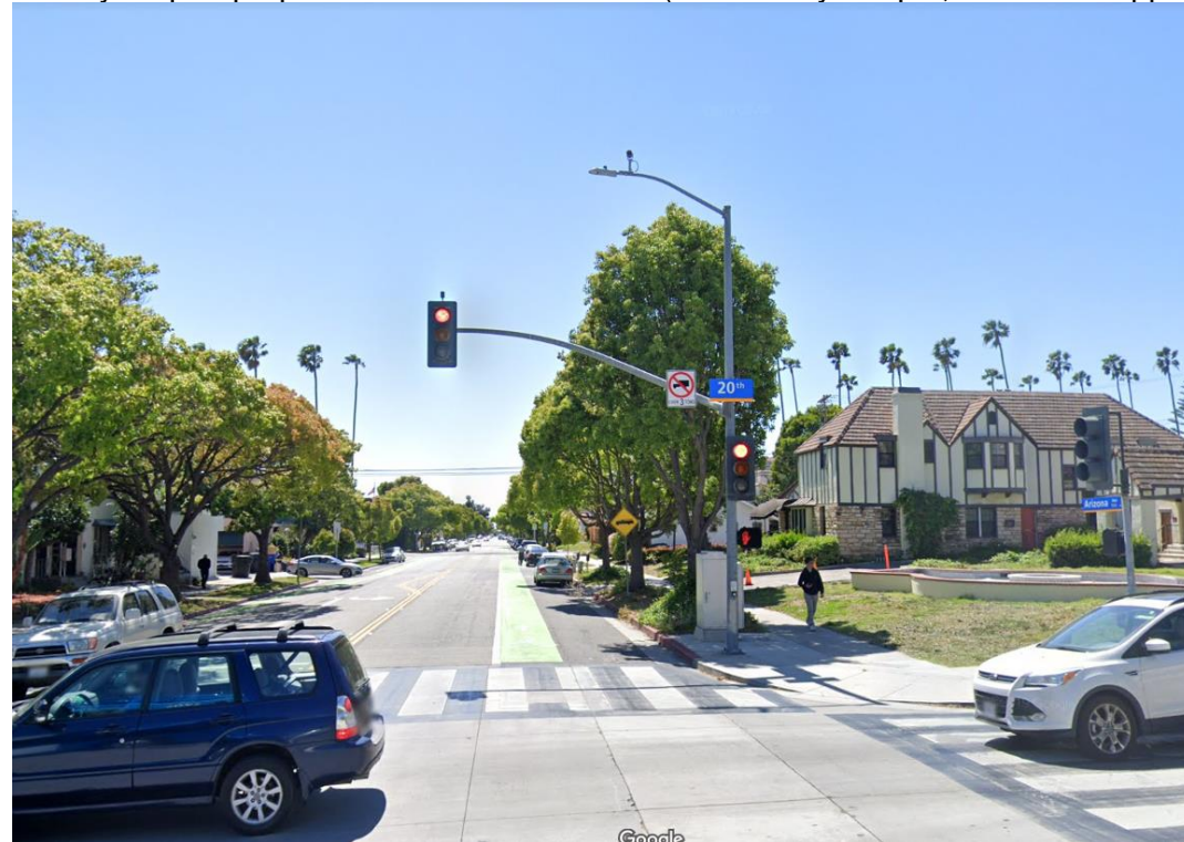
Street view of proposed installation location (looking west on Arizona Ave)