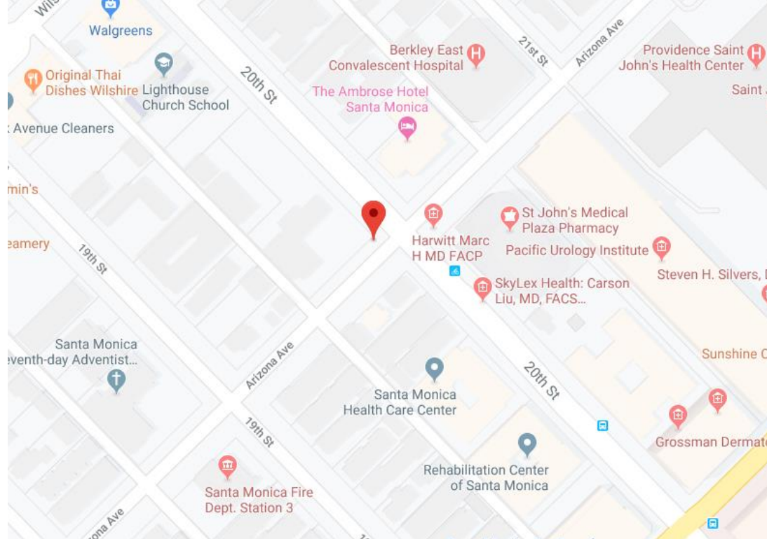
Vicinity map of proposed installation location (denoted by red pin; location is approximate)