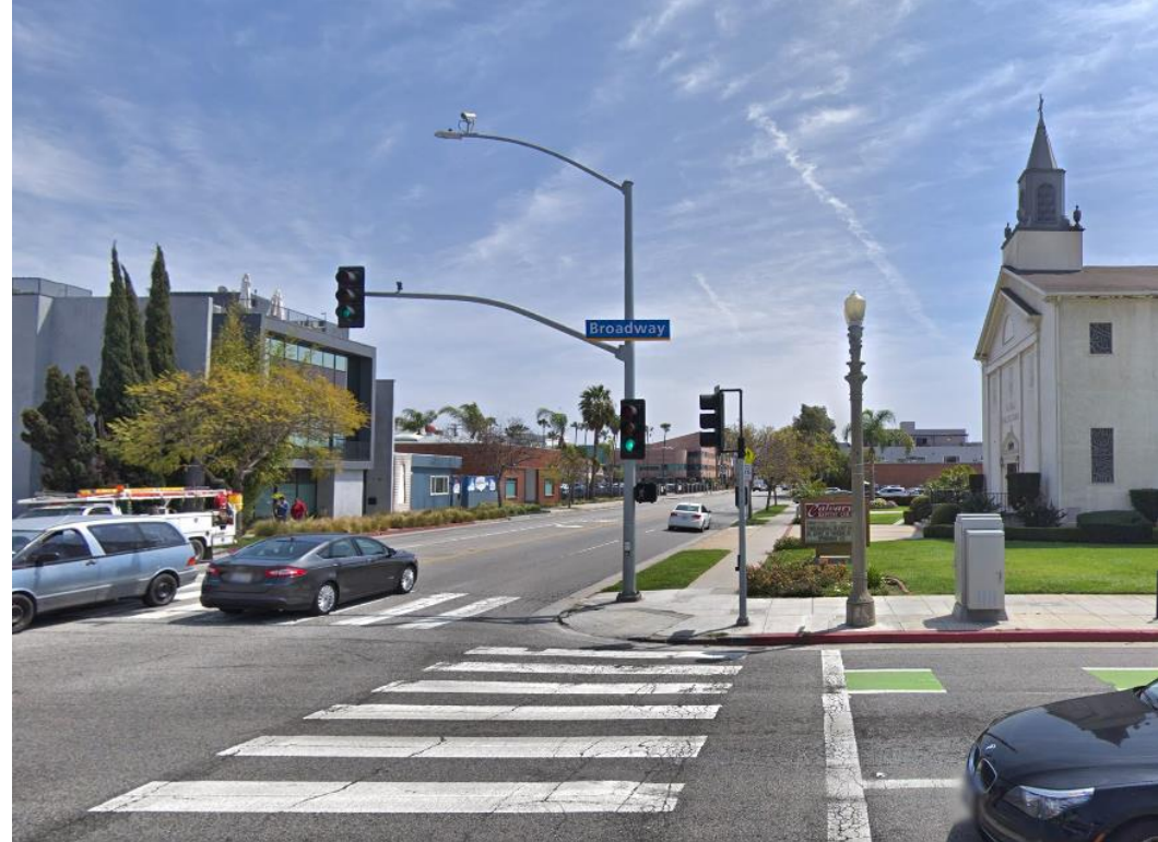
Street view of proposed installation location (looking south on 20 th St)