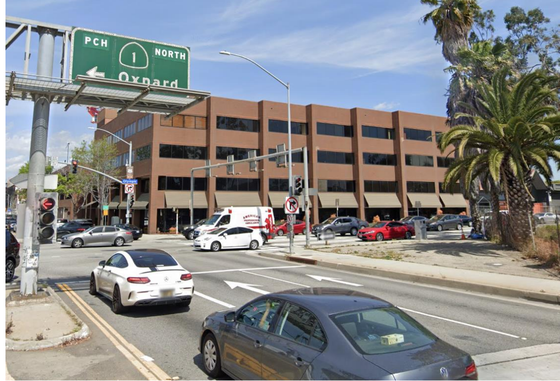
Street view of proposed installation location (looking north on Lincoln Blvd)