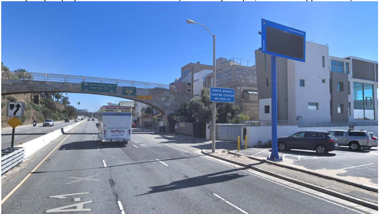
Street view of proposed installation location