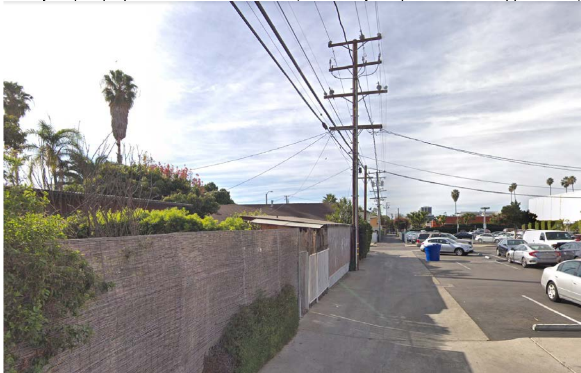
Street view of proposed installation location (looking west on Santa Monica Place South)