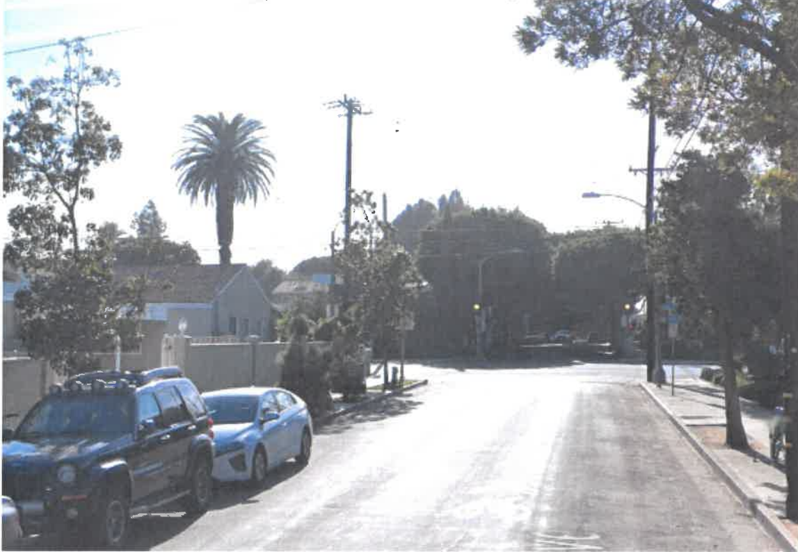
Street view of proposed installation location (looking west on Virginia Ave)