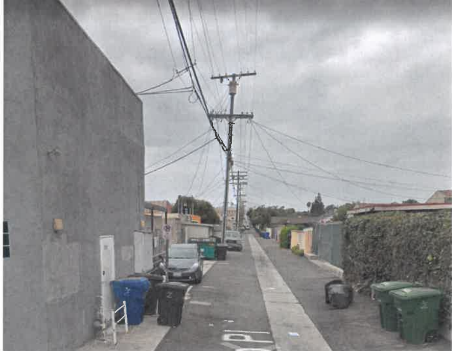
Street view of proposed installation location (looking west on Pico Pl)