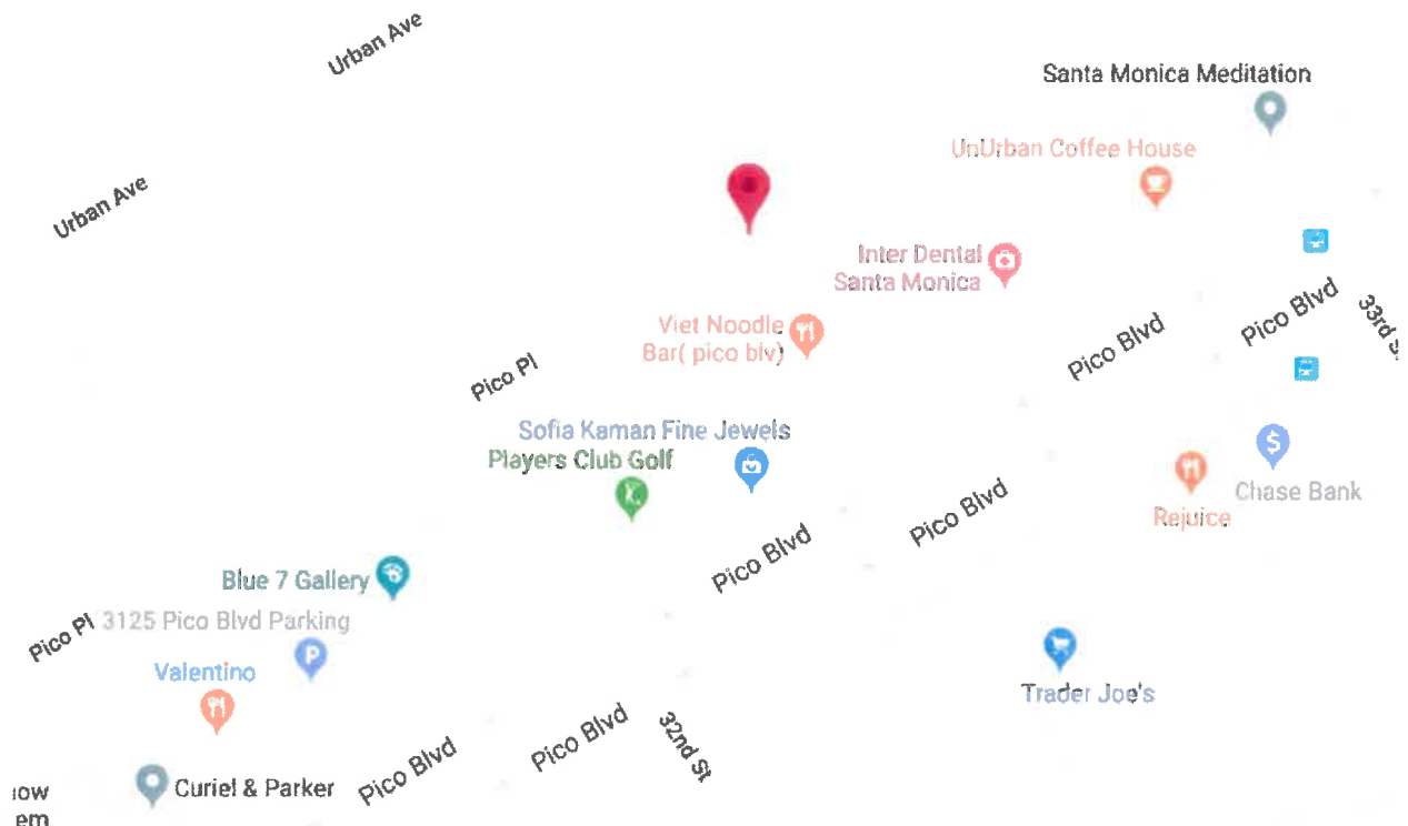
Vicinity map of proposed installation location (denoted by red pin; location is approximate)