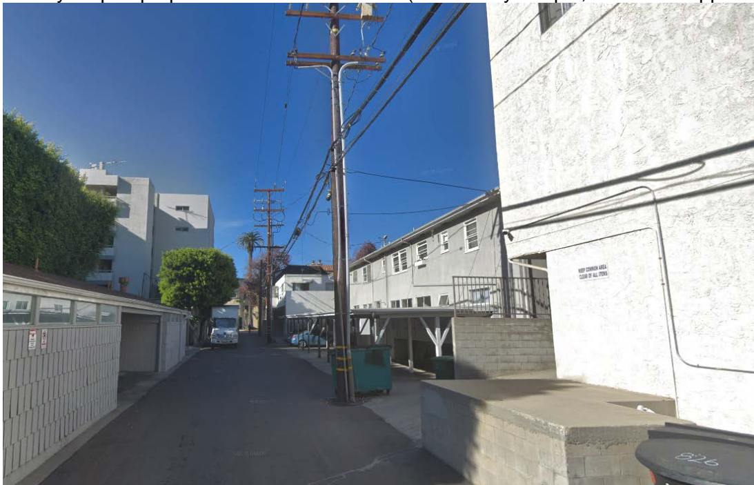
Street view of proposed installation location (looking north on 1 st Ct)