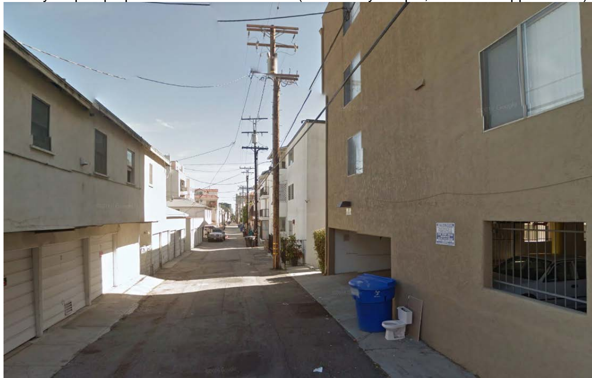
Street view of proposed installation location (looking north on 2 nd St)