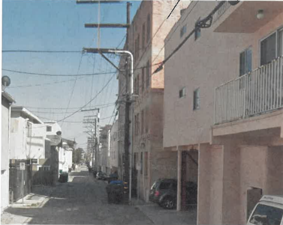
Street view of proposed installation location (looking south on 4 th Ct)