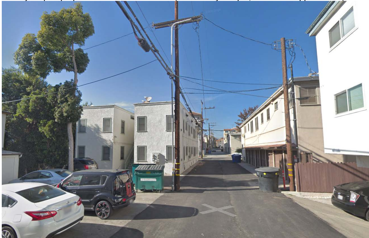
Street view of proposed installation location (looking north on 2 nd Ct)