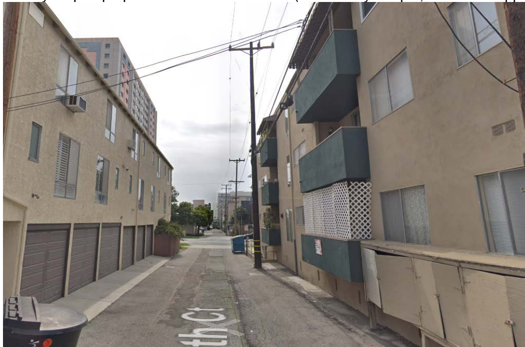
Street view of proposed installation location (looking south on 6 th Ct)