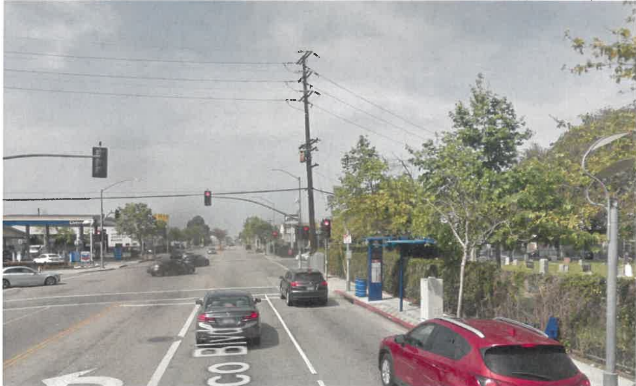
Street view of proposed installation location (looking east on Washington Ave)