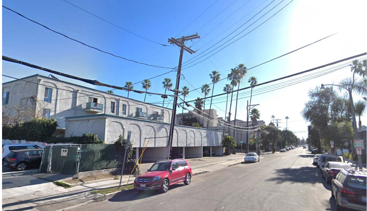
Street view of proposed installation location (looking south on 3 rd St)