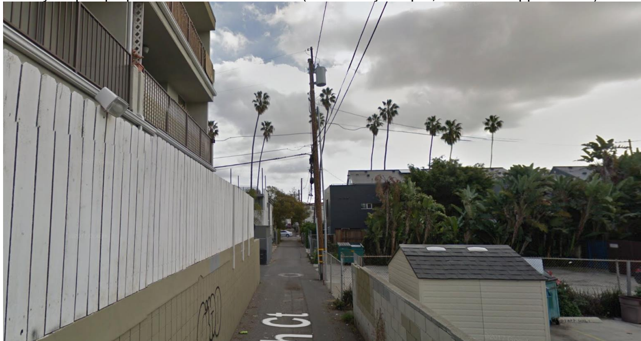
Street view of proposed installation location (looking south on 4 th Ct)