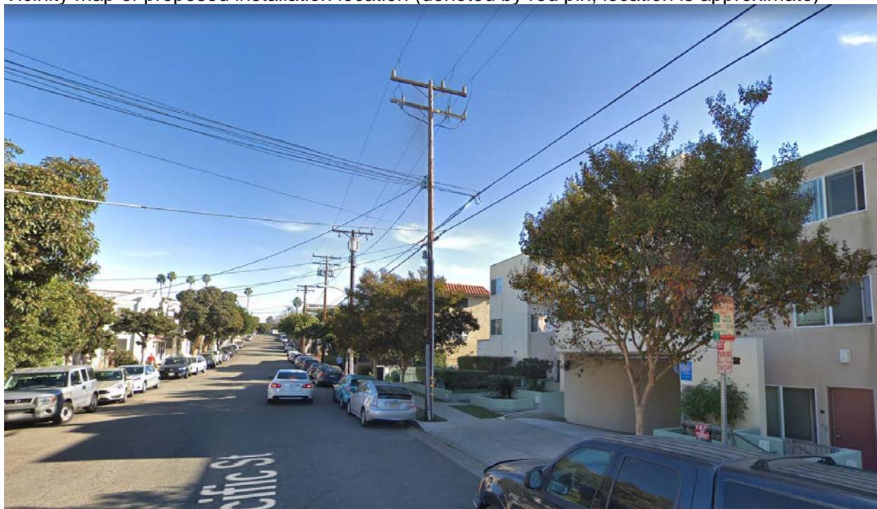
Street view of proposed installation location (looking east on Pacific St)