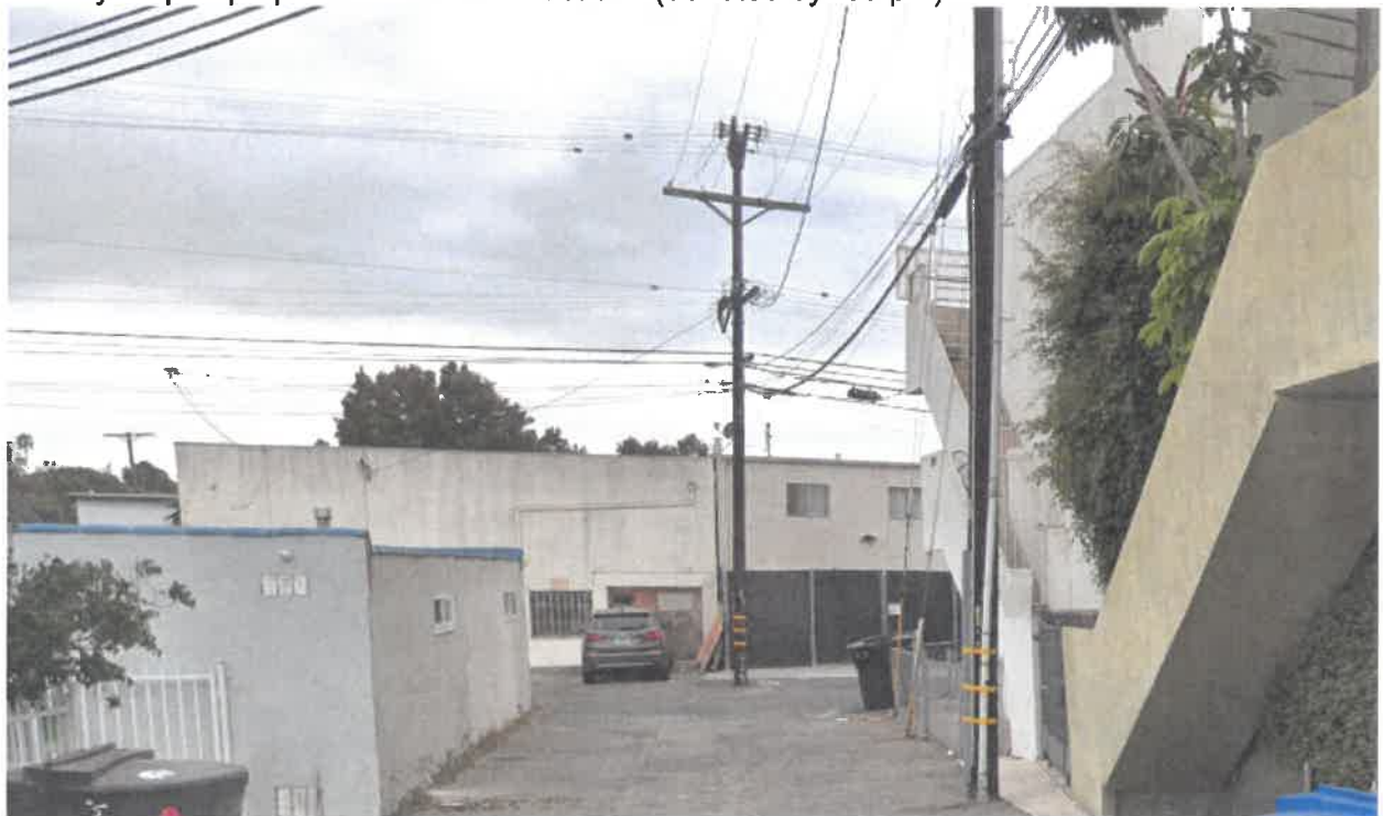
Street view of proposed installation location