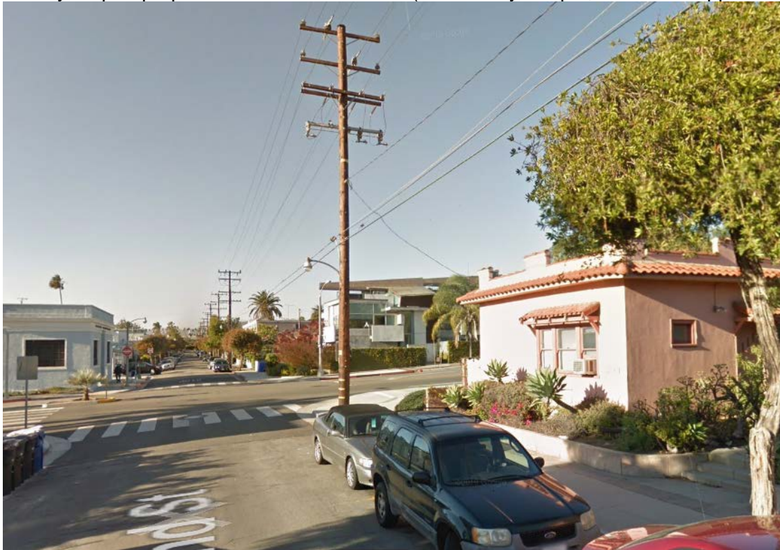
Street view of proposed installation location (looking north on 2 nd St)