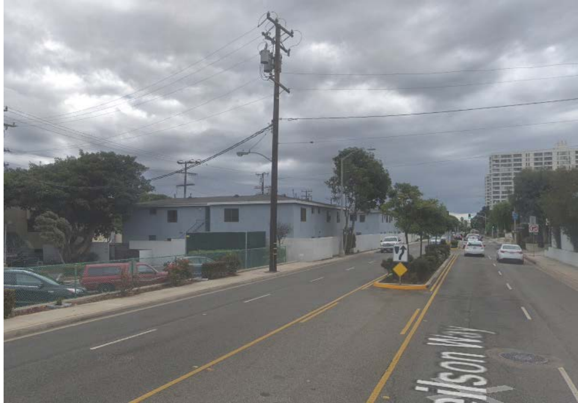
Street view of proposed installation location (looking south on Neilson Way)