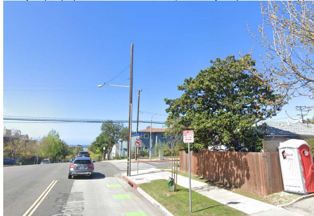
Street view of proposed installation location (looking west on Ocean Park Boulevard)