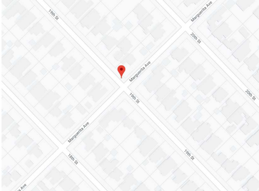
Vicinity map of proposed installation location (denoted by red pin; location is approximate)