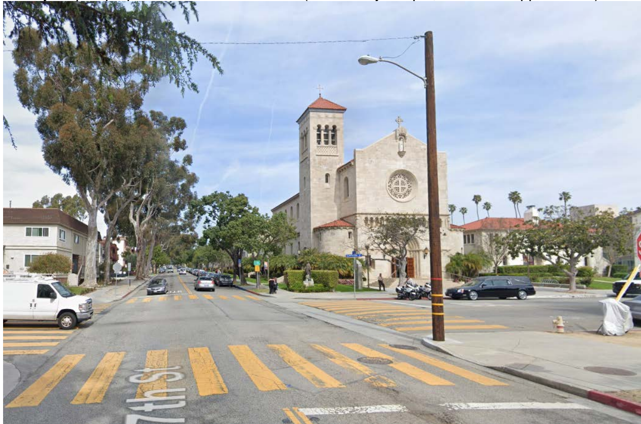
Street view of proposed installation location (looking north on 7 th St)