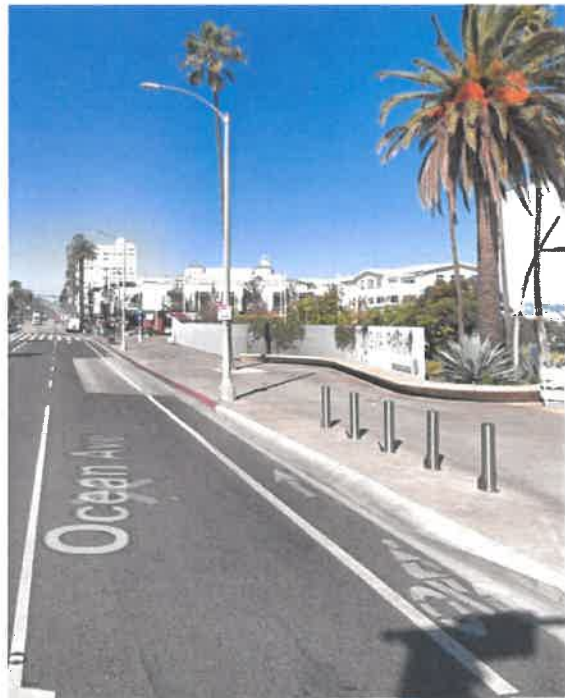
Street view of proposed installation location