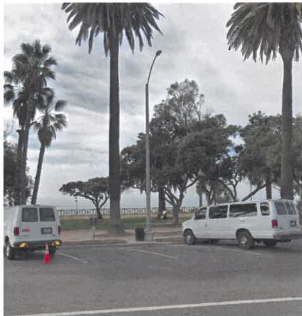
Street view of proposed installation location