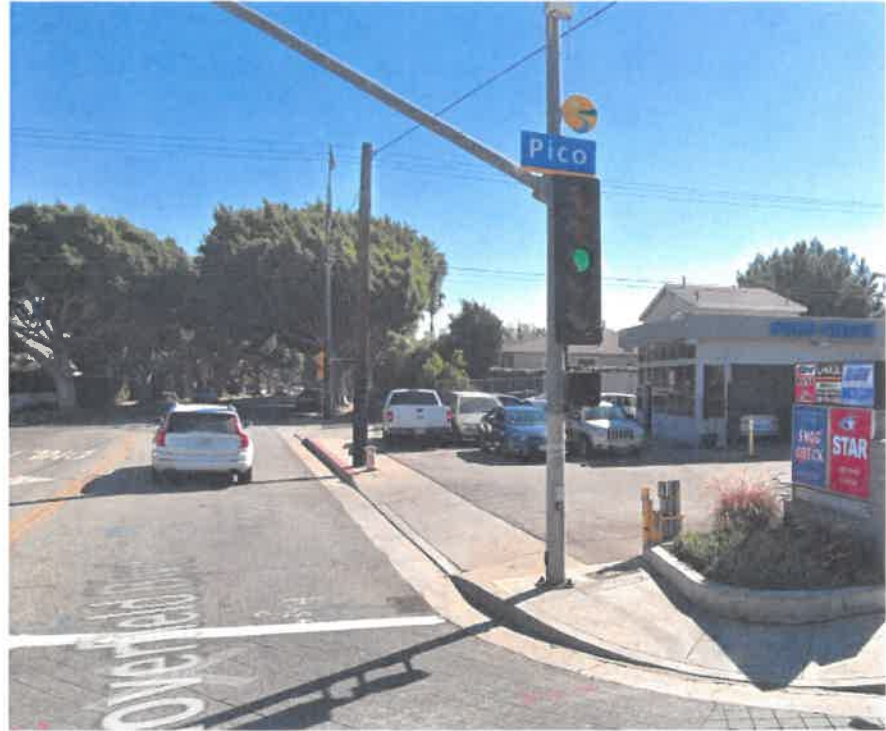
Street view of proposed installation location