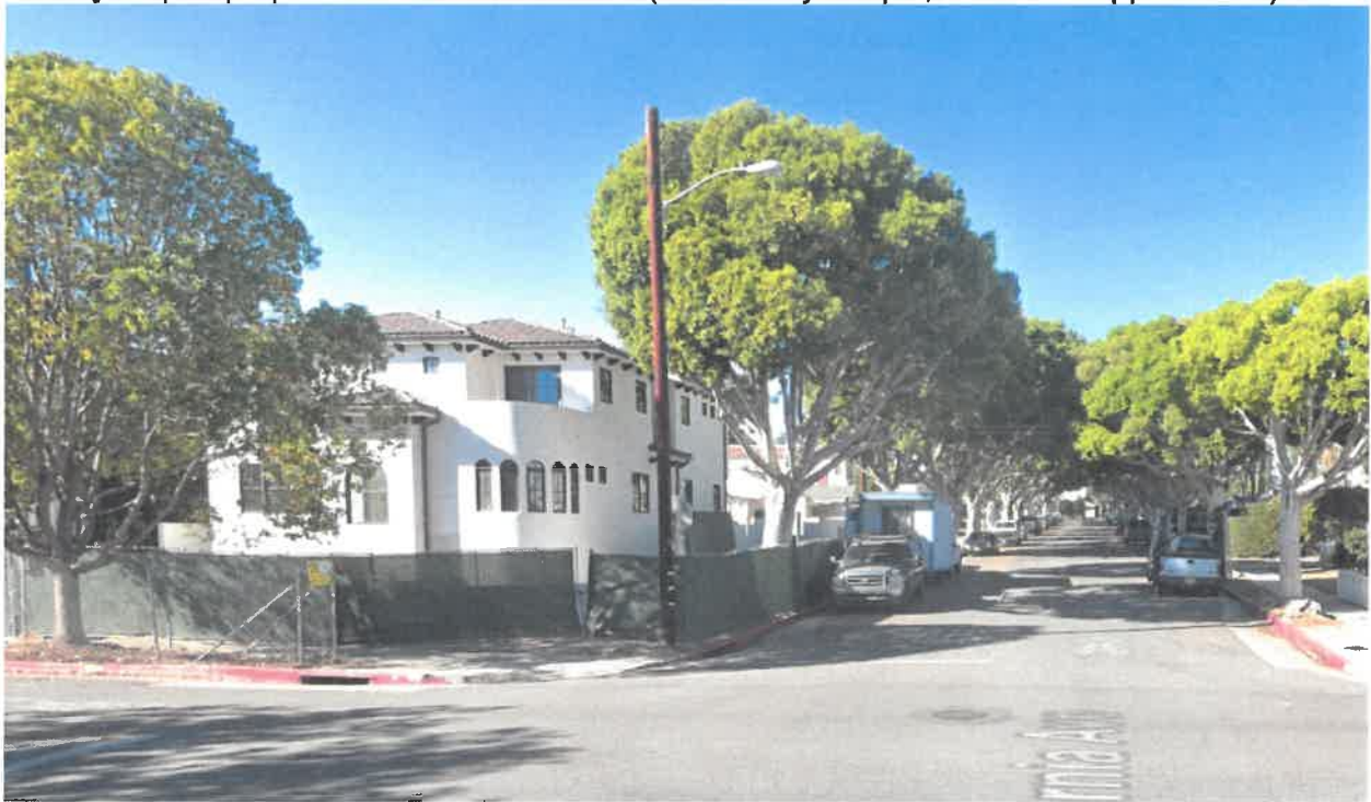
Street view of proposed installation location (looking north on Chelsea Ave)