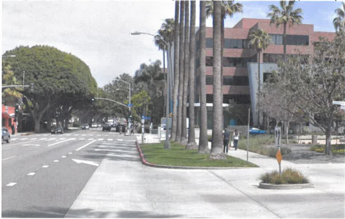
Street view of proposed installation location (looking east on Colorado Ave)