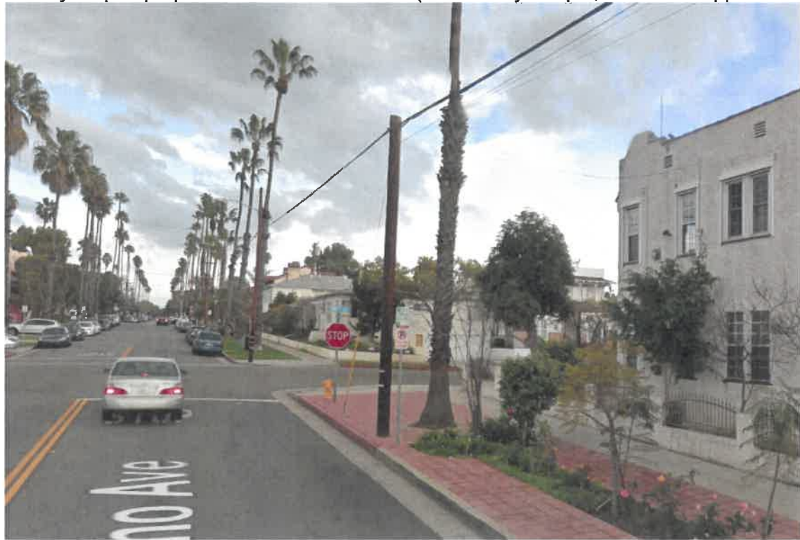
Street view of proposed installation location