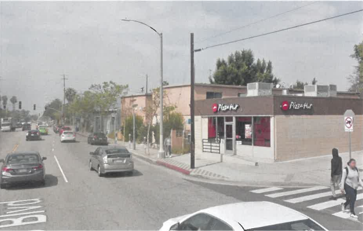
Street view of proposed installation location (looking west on Pico Blvd)