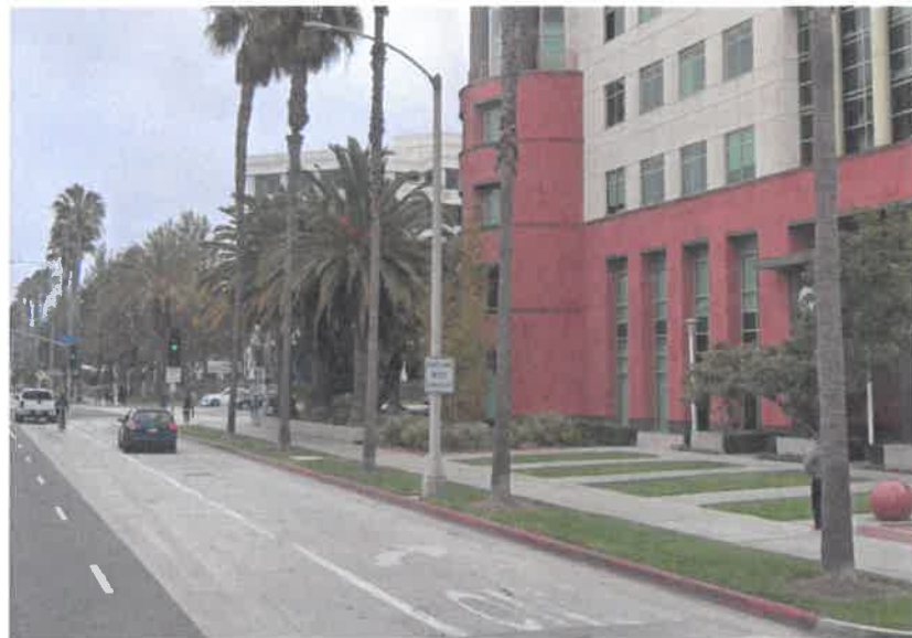
Street view of proposed installation location