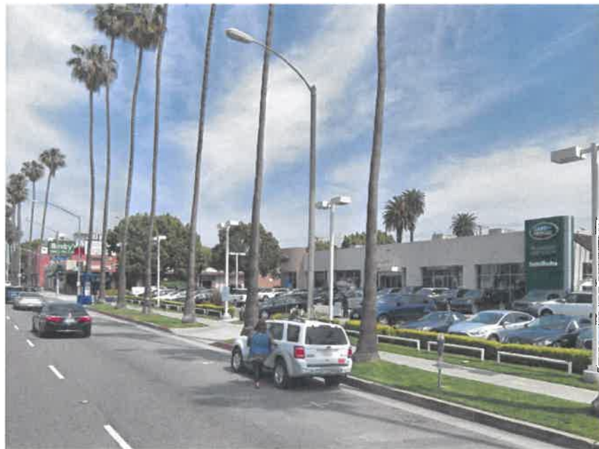
Street view of proposed installation location